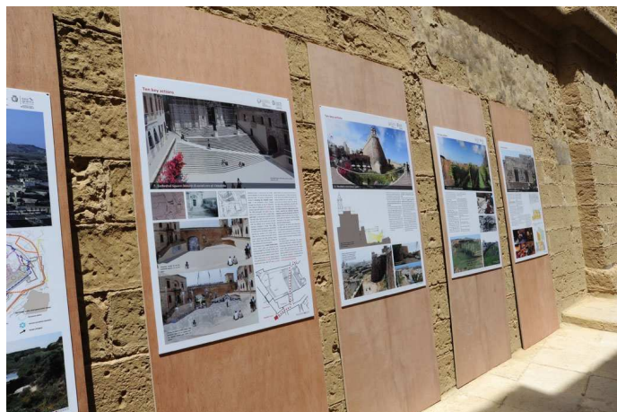
MT0005: An exhibition of posters displaying sections from the Masterplan during the project's closure event held at the Cittadella in June 2010