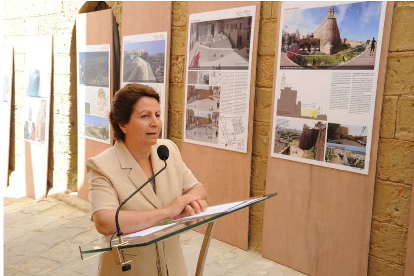
MT0005: Hon. G. Debono, Minister for Gozo, addressing those present at the closure event of the Cittadella Masterplan project