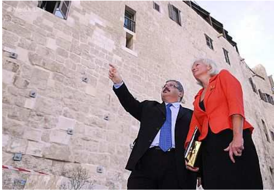
MT0012: Hon. G. Pullicino, Minister for Resources and Rural Affairs, showing H.E. Ms. E. Walaas Norwegian State Secretary for Foreign Affairs around the newly restored St Paul's Bastion, Mdina