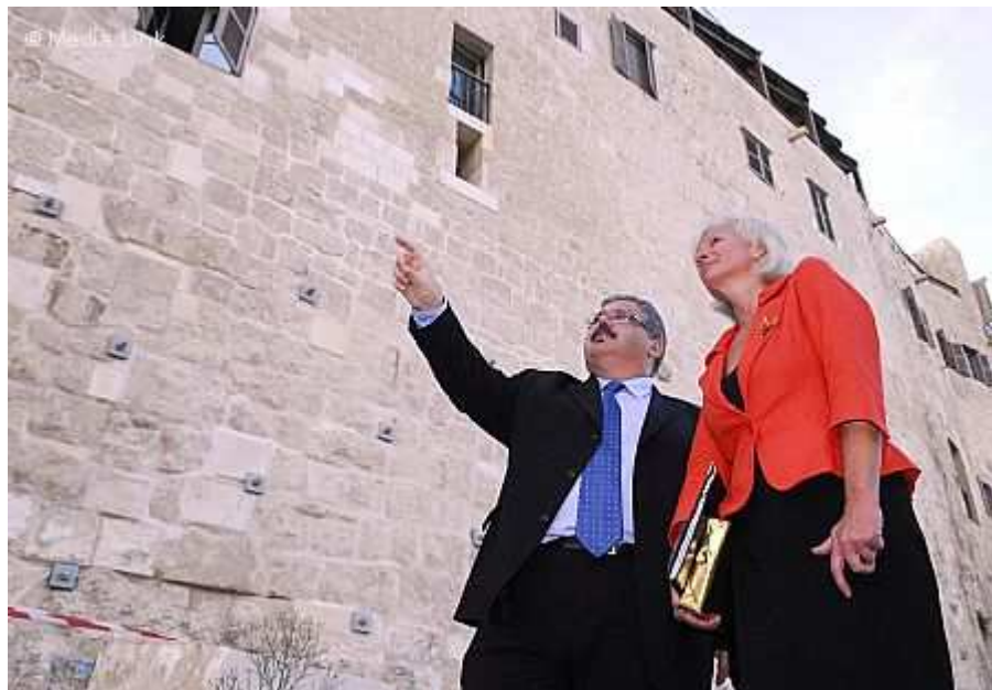
MT0012: Hon. G. Pullicino, Minister for Resources and Rural Affairs, showing H.E. Ms. E. Walaas Norwegian State Secretary for Foreign Affairs around the newly restored St Paul's Bastion, Mdina