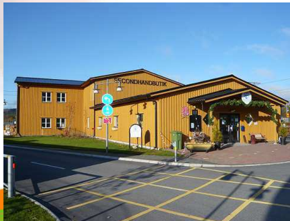
Alelyckan Re-use Park in Gothenburg, Sweden