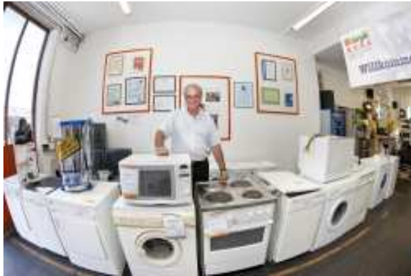
R.U.S.Z –Repair and Services Centre in Austria