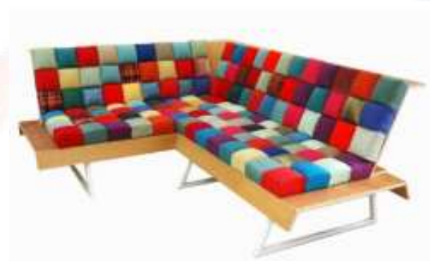
Ecomobel – Redesign of furniture in Germany